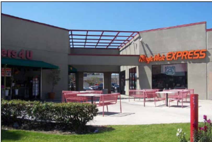
Food Court Area